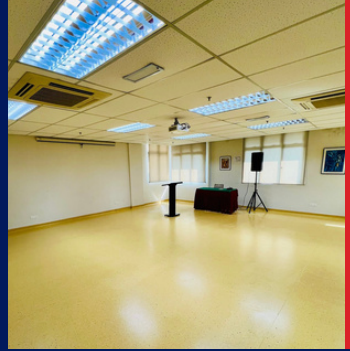
FUNCTION ROOM TWO