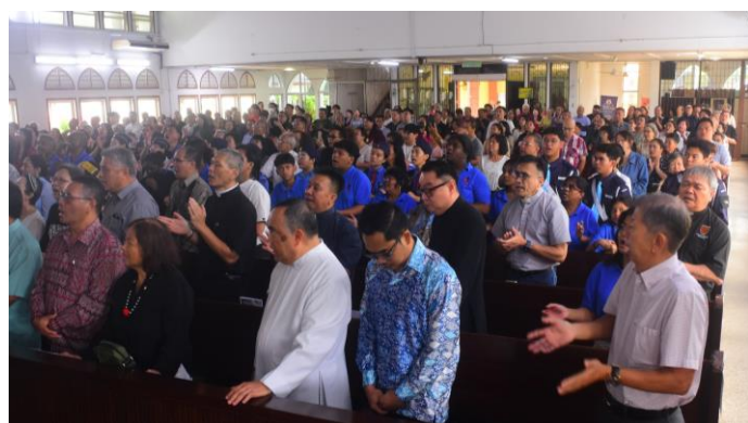
Sepanjang ibadah, himne dan lagu pujian memberi suara kepada doa umat; Doa pada hari itu meliputi banyak perkara.