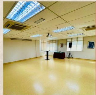
FUNCTION ROOM TWO