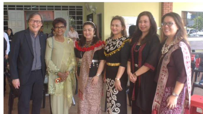
Perayaan ibadah ditutup dengan makan tengah hari bersama dan waktu persekutuan yang mesra; Penyatuan pelbagai budaya yang datang bersama.

* Dicetak pada September 25, 2025 , https://christianitymalaysia.com/wp/perhimpunan-hari-doa-malaysia-2025-gereja-st-faith-kuching-satu-seruan-kepada-kesatuan-dan-pengharapan/