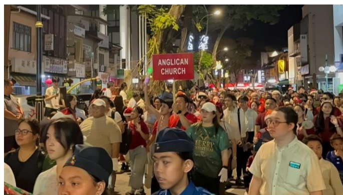
Colourful lights brighten the night as the annual Kuching City Christmas Parade makes its way through the city; A sea of lights and people fills the streets as the procession moves through the city on Dec 6, 2025.

KUCHING (DEC 7): THOUSANDS of participants and spectators packed the streets last night as the Methodist Church SCAC led the Kuching City Christmas Parade, transforming the city centre into a vibrant display of faith and celebration.