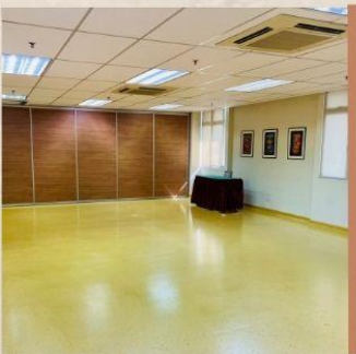
FUNCTION ROOM ONE