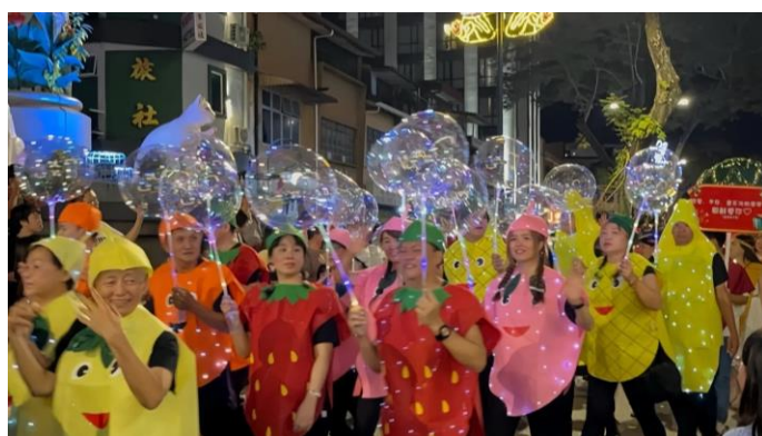
A singing group delivers festive songs; Church members dressed in colourful fruit costumes march along the route during the Kuching City Christmas Parade on Dec 6, 2025.

* https://dayakdaily.com/united-in-faith-churches-illuminate-kuching-city-christmas-parade-2025/