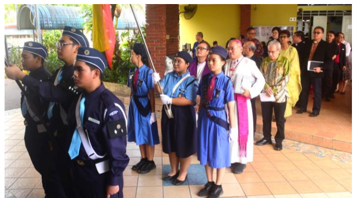
Gereja St Faith dipenuhi orang semasa perayaan ibadah Hari Malaysia; Para paderi, ahli koir, dan pemimpin pujian melangkah masuk ke ruang ibadah.