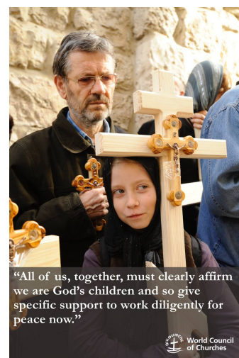
50 Moments for #JusticeAndPeace