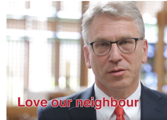
Invitation to Season of Creation