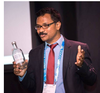
World Water Week