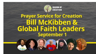
Online prayer for Creation