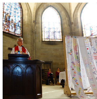
500 years of Reformation