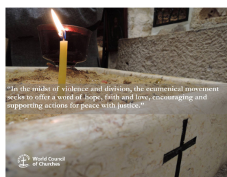
50 Moments for #JusticeAndPeace