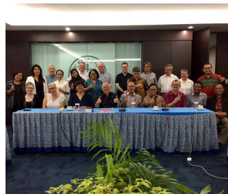
Week of Prayer for Christian Unity 2019

On Monday, 18 September at 10:30, an exhibition of hope for justice and peace will open at the Ecumenical Centre in Geneva amid a global ecumenical gathering of 45 representatives from all over the world.