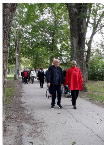
Ecumenical Disability Advocates Network